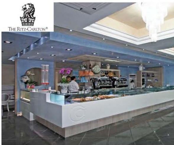
Oscartek GEM model