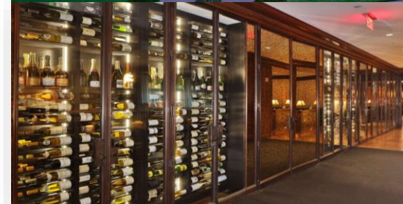
Oscartek Gala series an integral part of the remodel