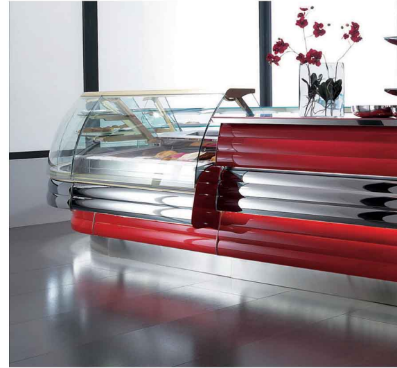
Photo shown is with optional front finish and champagne trim finish. Standard cases are silver trim finish, unfinished front, and stainless steel skin sides